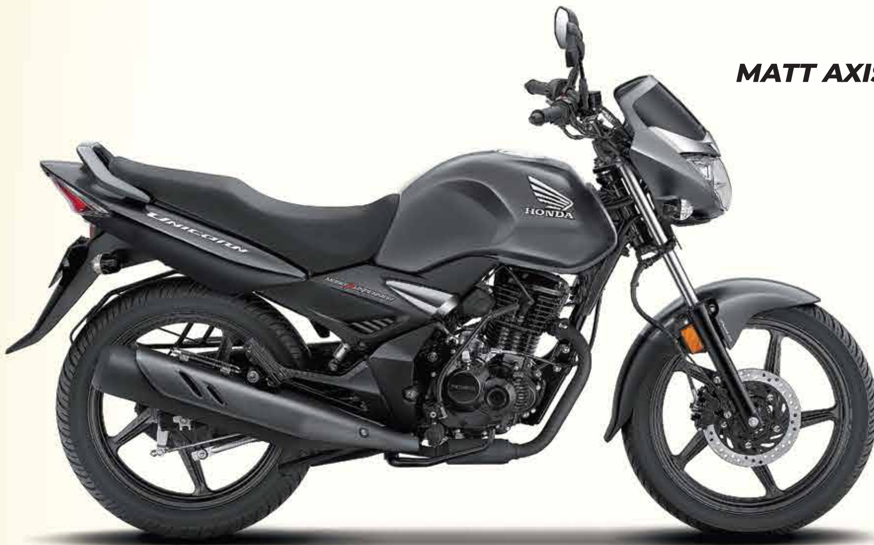
MATT AXIS GREY METALLIC