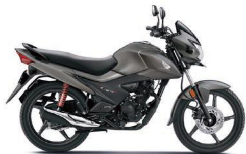
MATT CRUST METALLIC